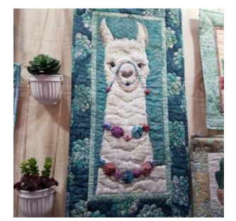
New from Hoffman