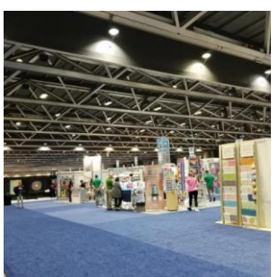
Market floor. The elevator takes you up to the floor, right in the middle. Half the market is to left (showing) the other half to the right.