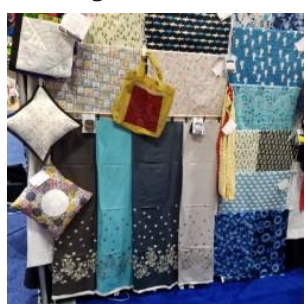
Fun linen/cotton fabrics--didn't order, but might...