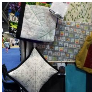
More sashiko. I've ordered from 2 different companies, so we'll see which company we like the best, or both!