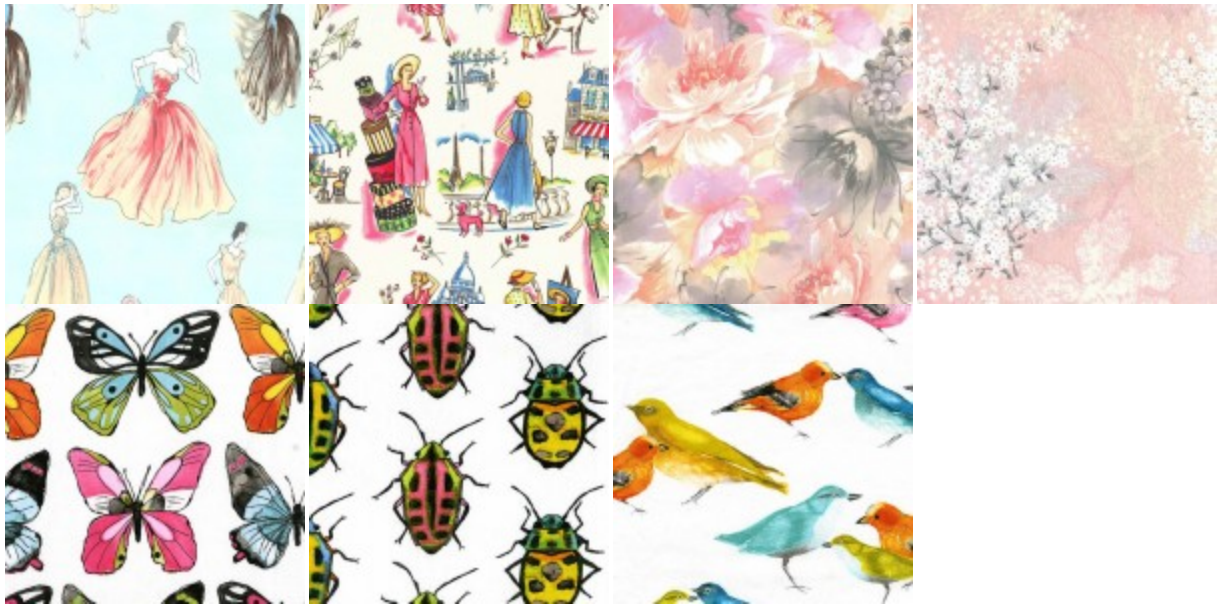
From Free Spirit: