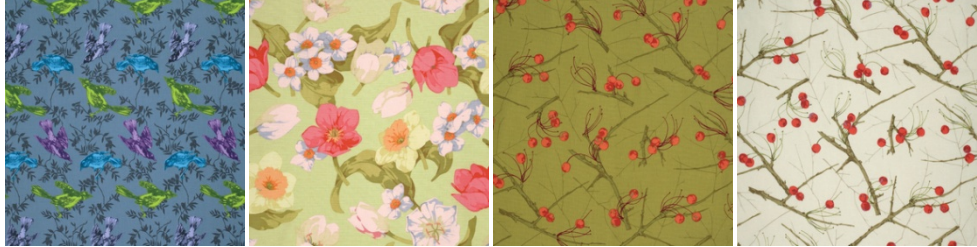
From Henry Glass: Steppin' Out