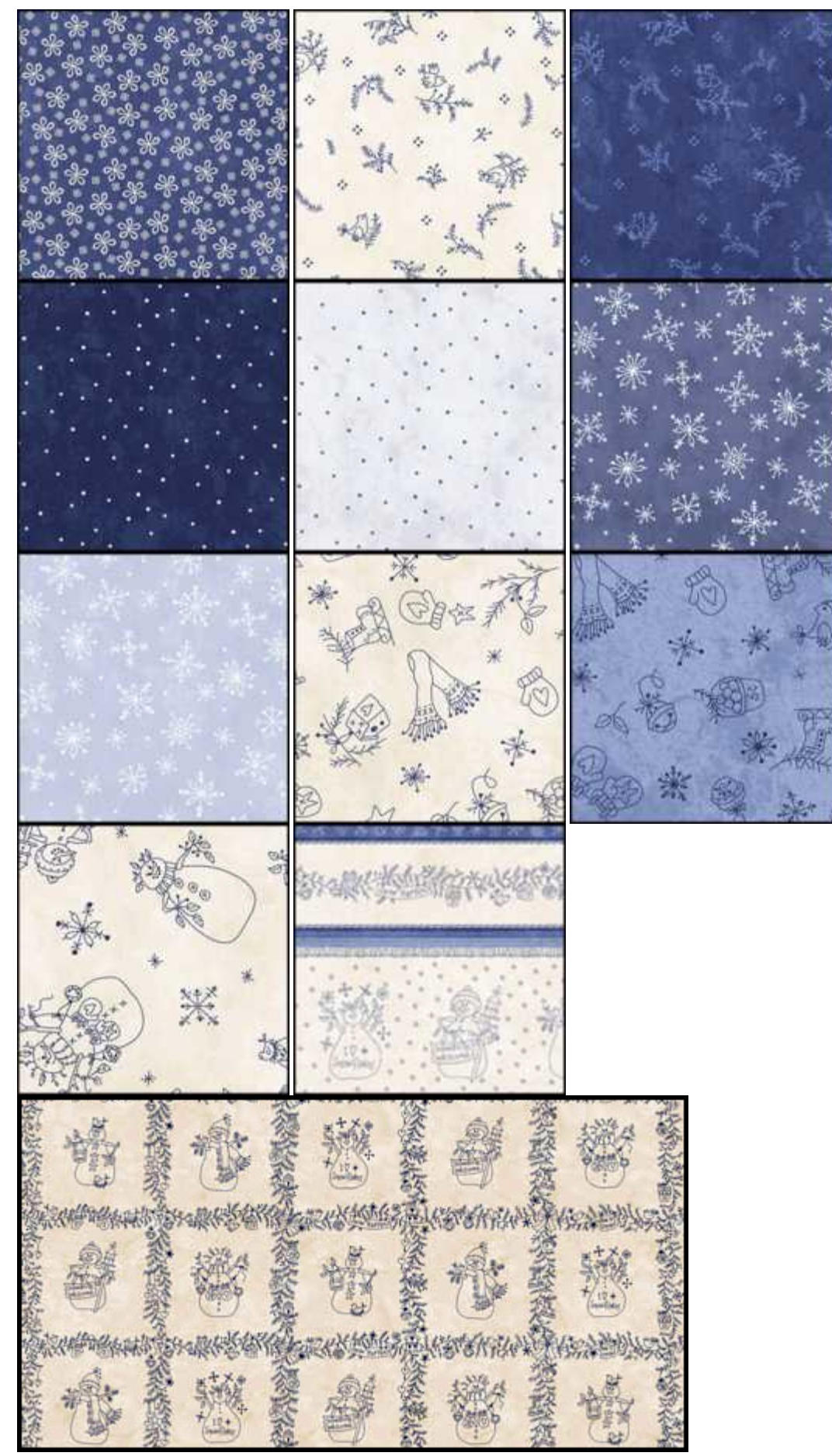
From Exclusively Quilters: