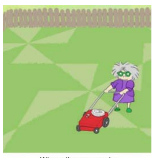
Why quilters are rarely asked to mow the lawn.

My frig came in, thought you'd want to know. It fits, but I almost don't. When I measured, I was only concerned with making sure it would fit in the space allotted and that the doors could open. It didn't occur to me that I needed to fit in the space as well. I never thought to add my hip measurement to the mix of things to know. They don't have that category on the product information sheets, BTW. So I now have an incentive to lose weight -- or at least not gain any. The good news? The frozen pizzas fit!