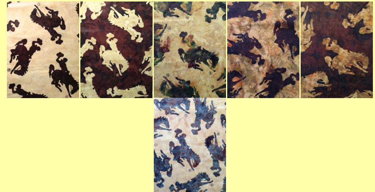
Bucking Horse and Rider fans!

Hoffman is printing our beloved "Steamboat" on fabric! If you are interested in this fabric, please let me know quickly. I have placed my order, but I did order extra bolts. If you haven't yet placed an order and want the fabric, don't wait until it gets here. It may sell out before it arrives.