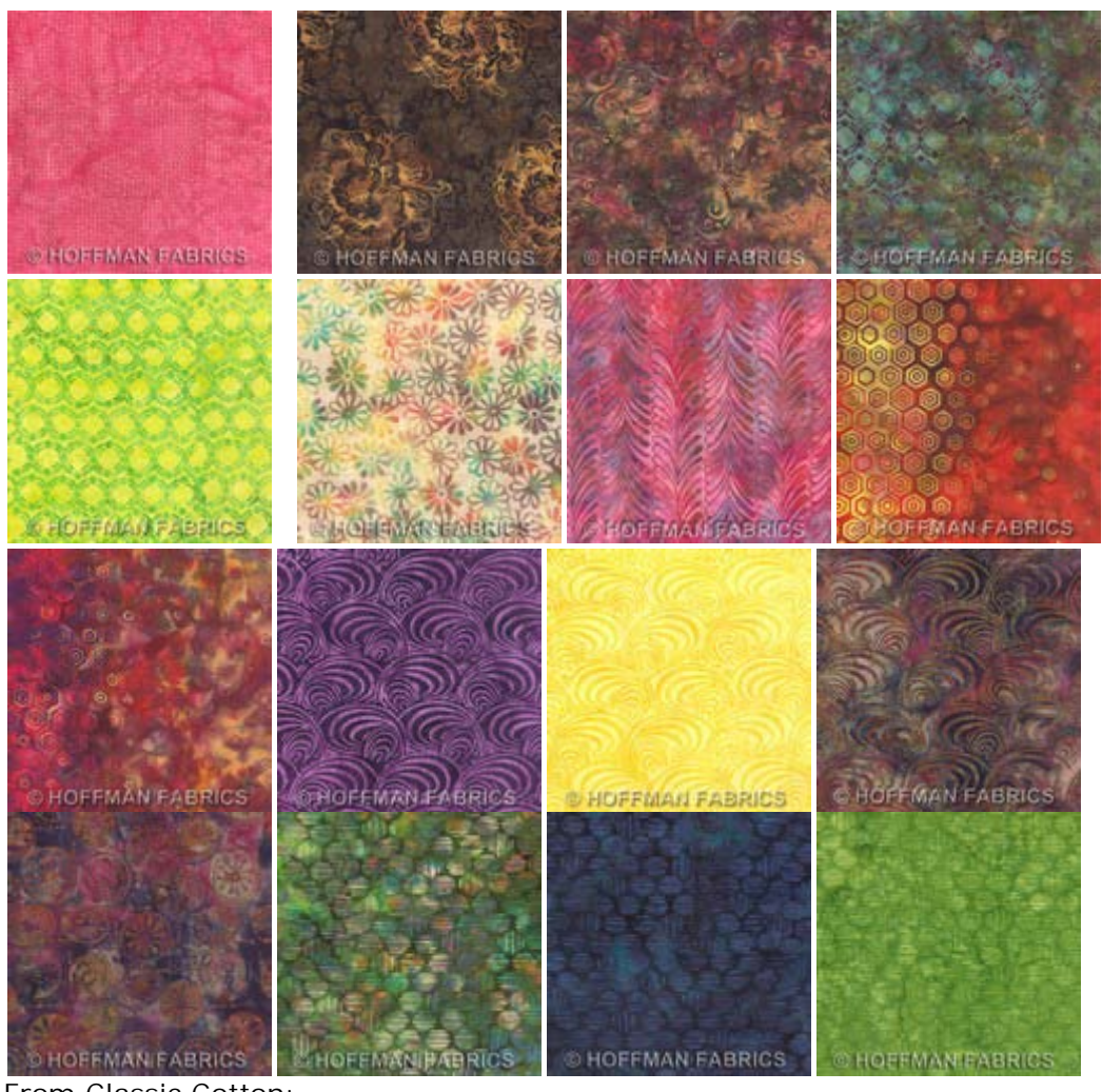
From Classic Cotton: