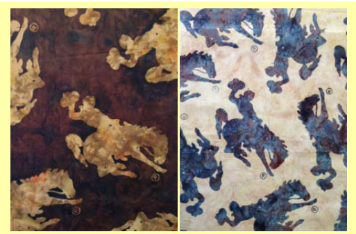
Bucking Horse and Rider fans!

I got to see the fabric live in person this week. And the Moss and Buckskin fabrics are startling beautiful. And I have learned there is no more to be had. I will be able to order in October for more fabric in all 6 colors, delivery date in May. But if we don't get enough orders placed, for any one color, Hoffman won't be able to print that color.