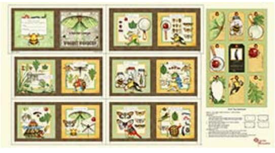
Elle: From Quilting Treasures: