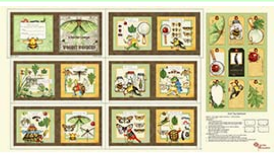
Elle: From Quilting Treasures: