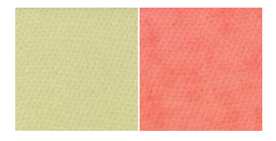
From Timeless: the horses are flannel